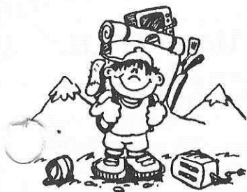
"I'm goin' to C/A Camp"