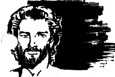
Might See Jesus!